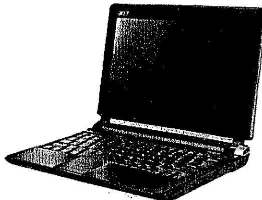
Acer Netbook Retail Value $330.00